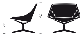
JL 10 - JL 11

*Test method depends on local/national standards. Only complied with in the case of certain types of fabric.